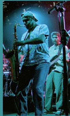
FOR ALL PUBLISHING INFO PLEASE VISIT WWW.SCIONTHEROAD.COM/PUBLISH

WWW.STRINGCHEESEINCIDENT.COM WWW.SCIONTHEROAD.COM