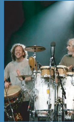
FOR ALL PUBLISHING INFO PLEASE VISIT WWW.SCIONTHEROAD.COM/PUBLISH

WWW.STRINGCHEESEINCIDENT.COM WWW.SCIONTHEROAD.COM